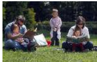
Society, Family, Education