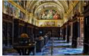
History & Contemporary events