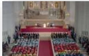
Social Doctrine of the Church