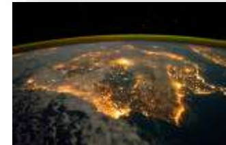
History of Science