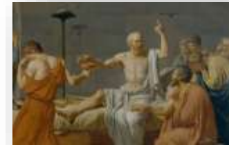
Ethics applied to Business & Tecnology